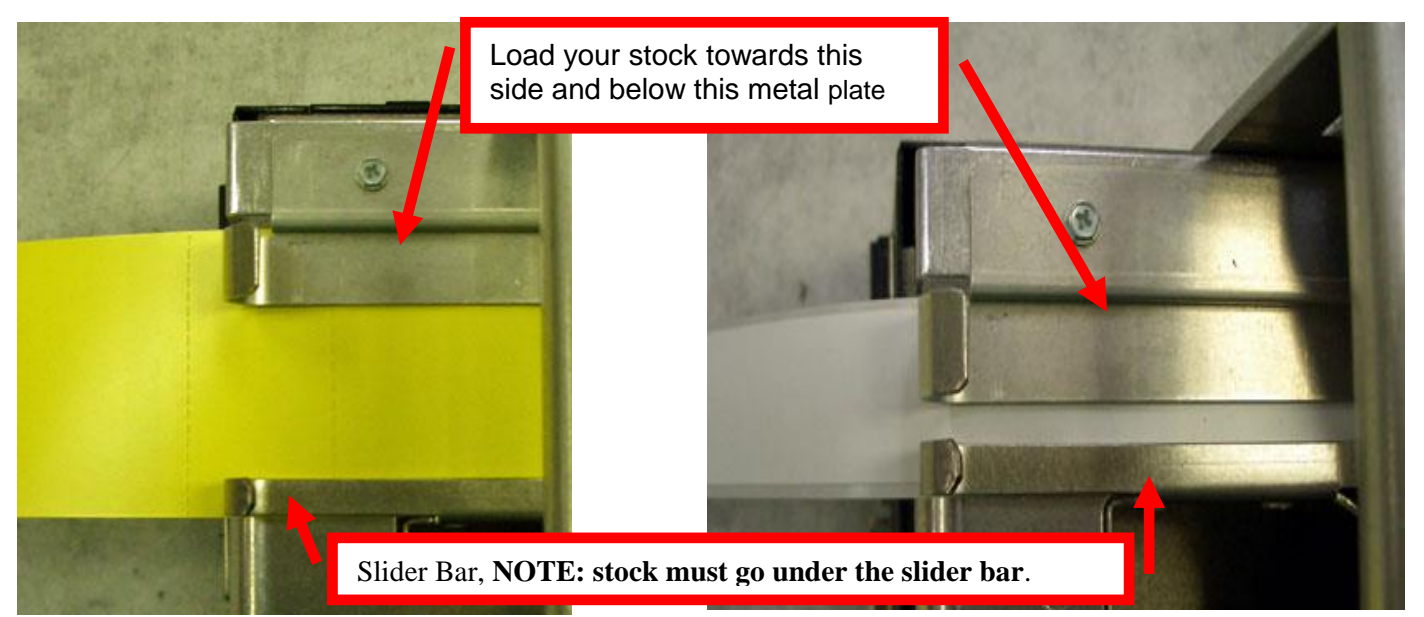
Above photo is of ADJ2 set for 2" wide stock